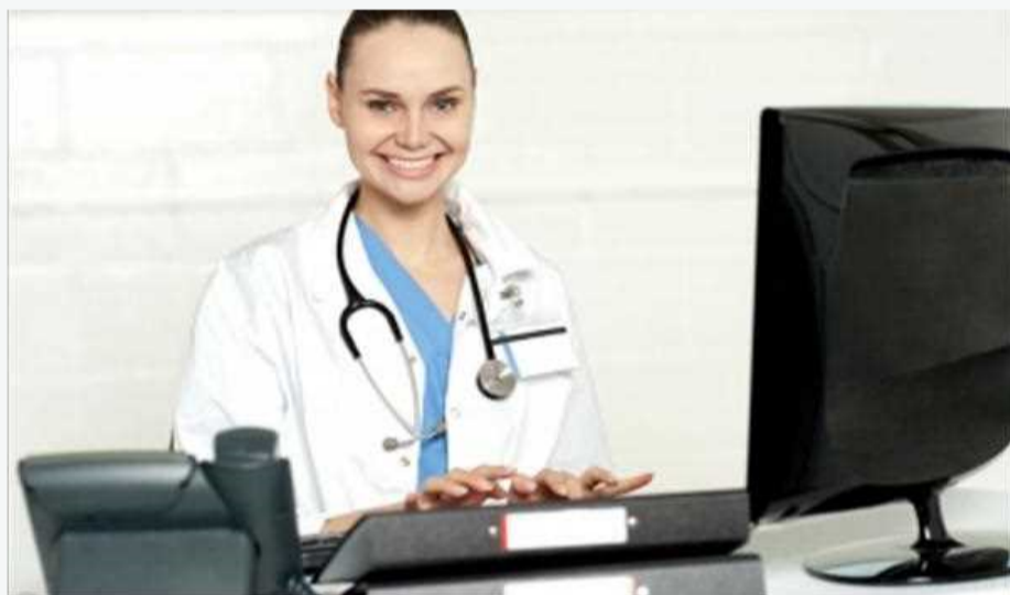
HemorrhoidHemorrhoidsHemorrhoid TreatmentNatural Hemorrhoid

Related scientific study on the effects of fiber on hemorrhoid patients also showed relief from itching, discomfort, and pain.