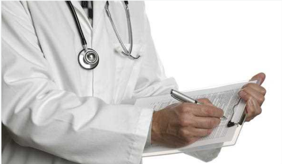
HemorrhoidsSitz Bath HemorrhoidsHemorrhoid

Even the doctors can tell you that the sitz bath hemorrhoids is an effective way of decreasing any swelling in the anal area. It can also relax any tension and trauma. These factors are few of the reasons why hemorrhoids are so painful. If you would be able to take them away, you would just feel a mild discomfort and a little itchiness. Good thing you have the sitz bath to alleviate the pain. Remember that it is only good for mild and medium cases. If you have a extreme hemorrhoid, it may be time for you to consider some extreme means instead.