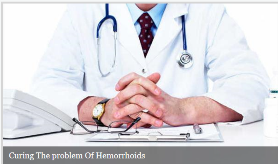
Curing The problem Of Hemorrhoids