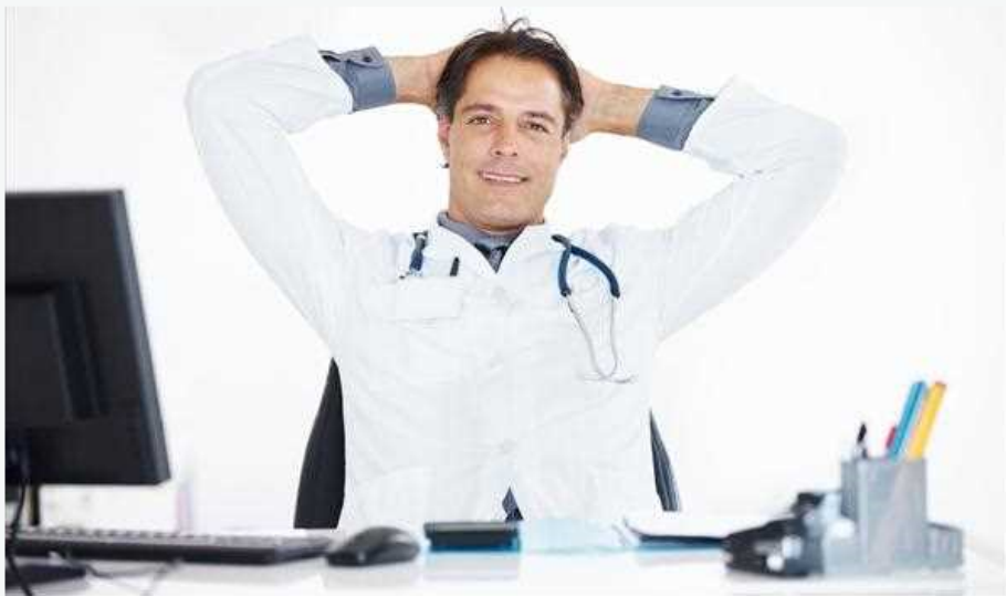
HemorrhoidsHemorrhoidBowelInternal Hemorrhoid SymptomsInternal

Usually people who are suffering from hemorrhoids ask themselves several questions just before determining which remedy to choose in order to cure their hemorrhoids. The following are three of the most common questions.