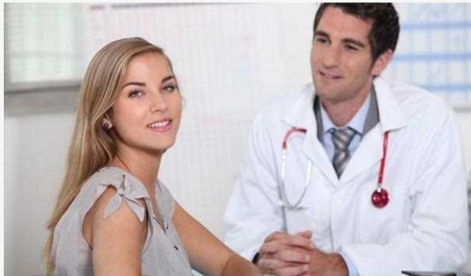
HemorrhoidsHemorrhoidInternal HemorrhoidsPainful Internal