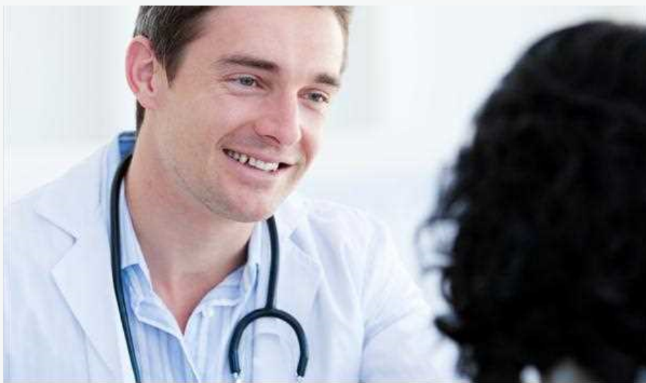
Hemorrhoid Hemorrhoid Treatment Hemorrhoids External Hemorrhoid

This is a process in which a chemical compound is injected to the hemorrhoid. What happens is just about the same with the first method mentioned. The blood supply is cut and the hemorrhoid will shrink. This method is said to be best used for recurring hemorrhoids.