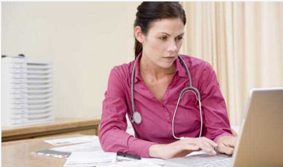
HemorrhoidsPilesBowelHemorrhoids Witch HazelHemorrhoid

This potion is good for hemorrhoids which are already bleeding. Petroleum jelly - When trying to defecate, lubricate the anal area with the use of petroleum jelly. Aloe vera may also be used. One of the most common causes of piles is trying to force a bowel movement. This can also make the hemorrhoids even worse and cause them to bleed. Salt - Consume less salt as it can promote retention of fluid in the circulatory system which can eventually cause bulging in the area around the anus. Pomegranate - To be able to cure hemorrhoids, peel a pomegranate and place the peelings in the bowl of water and bring the water to a boil. Every morning and every night, drink the liquid to help ease the discomfort and get rid of hemorrhoids.