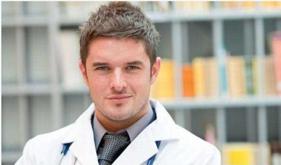
Hemorrhoids External Hemorrhoids Bowel Piles